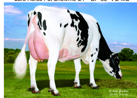
566HO1352 SHOWBIZ Grandam: S-S-I Manton 19755-ET "VG-88"